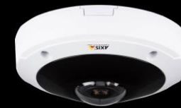
4 AXIS M3058 – PLVE CAMERA