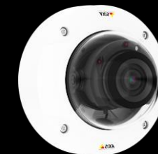
6 AXIS Q3517 – LV CAMERA