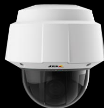
3 AXIS Q6125-LE PTZ CAMERA