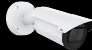
5 AXIS Q1785 – LE CAMERA