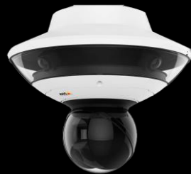
1 AXIS Q6100-E 360 PTZ CAMERA