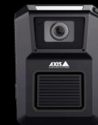
7 AXIS W100 - BODY CAMERA