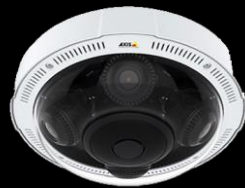
2 AXIS P3707 – PLE 360 CAMERA